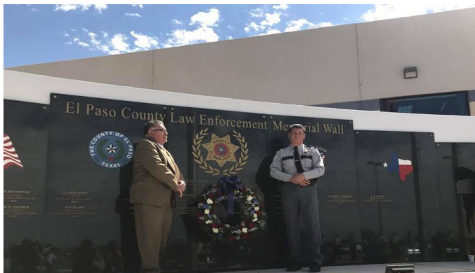
El Paso County Law Enforcement Wall Dedication Ceremony